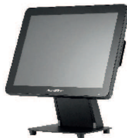
POS Touch Screen terminal